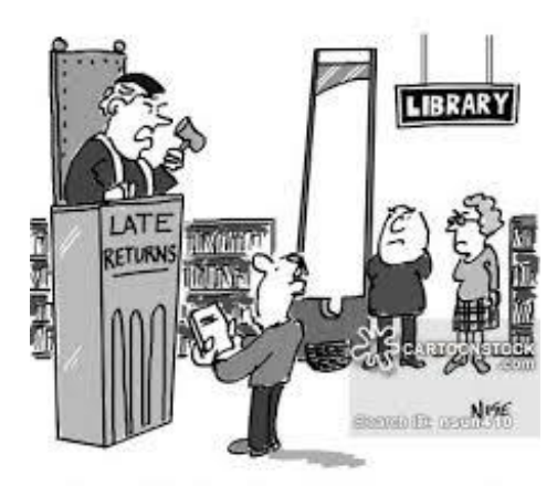
I DON'T THINK YOU'RE TAKING THIS SERIOUSLY